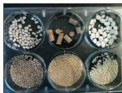
2 g samples of RPL products